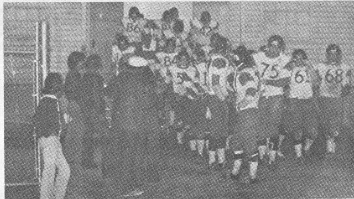
Royals at halftime against Bruins.